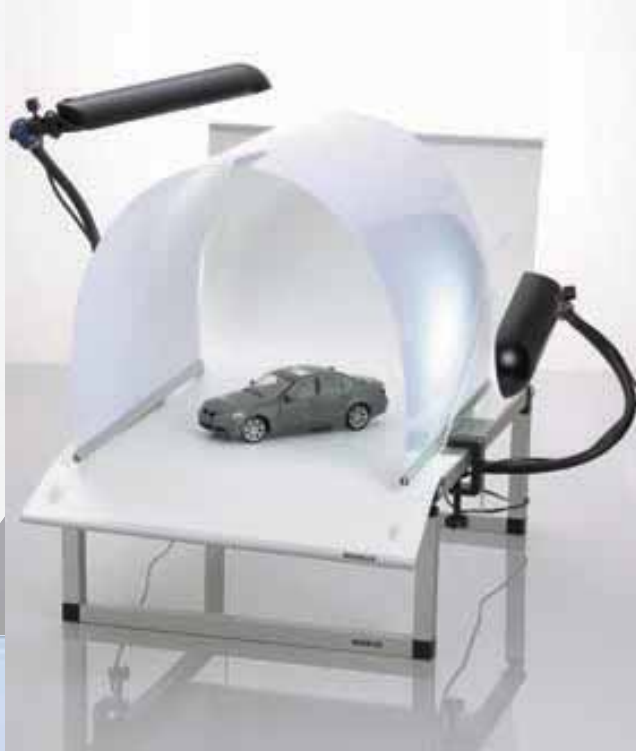
MAGICSTUDIO SET 50