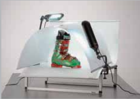
MAGICSTUDIO SET 80