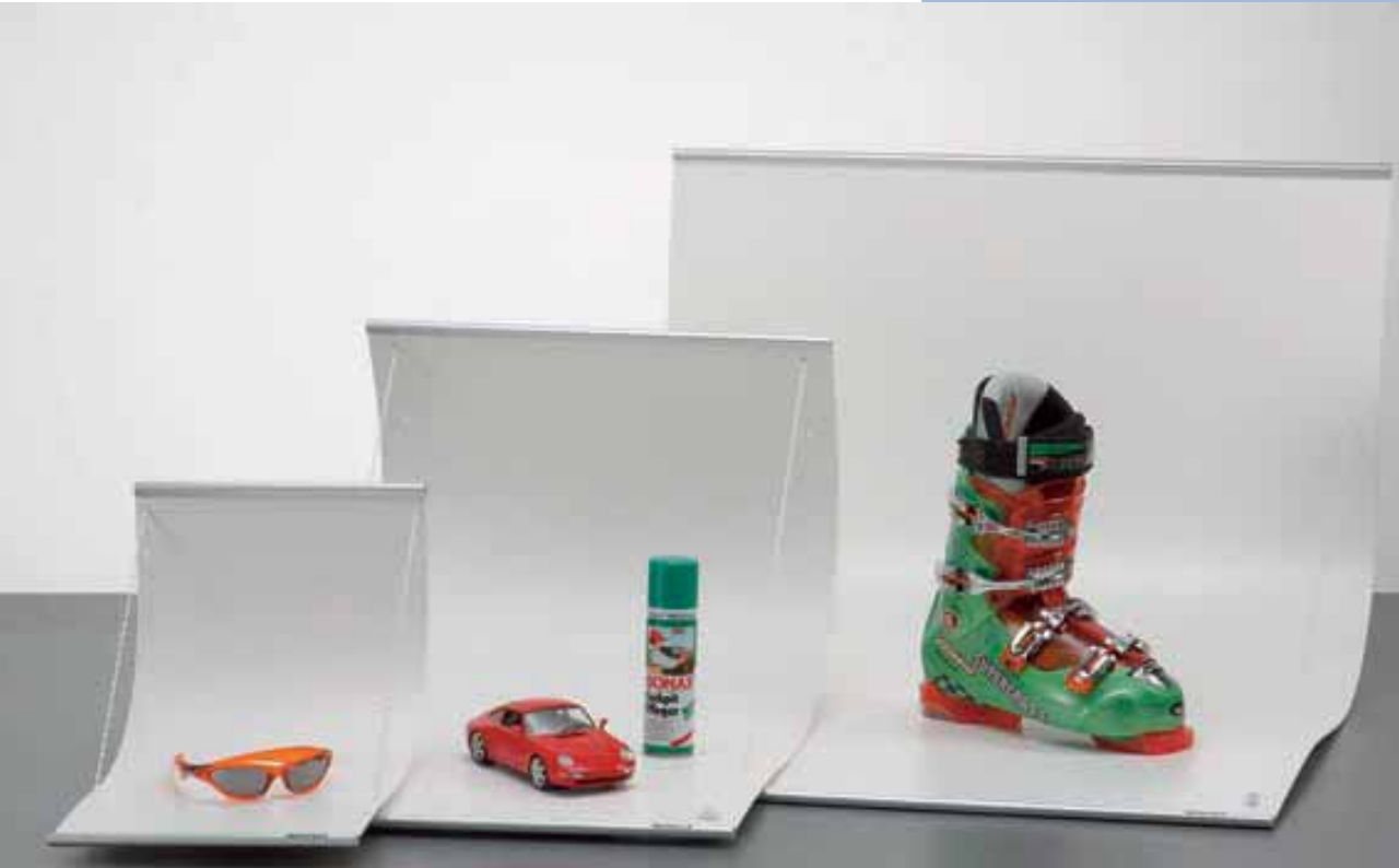
MS 30,MS 50,MS 80

You set up the simplest version of the NOVOFLEX MagicStudio by fixing the curve of the panel. This is done by threading the beaded cords through appropriate holes and clamping them in place. Once the sides are symmetrical, the MagicStudio is ready to use. One NOVOFLEX MS-Arm camera holder is enough to quickly and securely position a small compact camera for simple tasks. The lighting is provided by the camera's built-in flash.