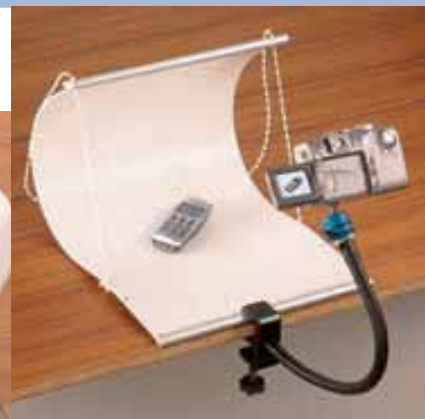
MAGICSTUDIO SET 30