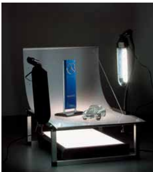
MS-TABLE 50, MST 50, 2X MS-LIGHT, LIGHTBOX

You can use the MagicStudio with passive or active lighting. If you're working with simple passive lighting for your still-life shots, often the available room or ambient light is quite sufficient for an adequate result. If you're using a camera with a built-in flash, we recommend that you bend the MagicStudio into a pronounced concave shape. The curved rear wall will then reflect the incident light back onto the subject, eliminating unwanted shadows. Simple and ingenious!