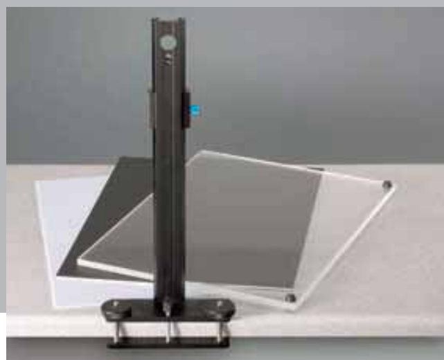
MAGICSTUDIO REPRO SET

NOVOFLEX now offers a totally new shooting technique for photographing flat objects – the new MS-Repro reprostand system.