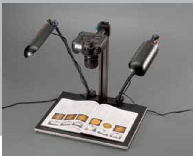
MAGICSTUDIO REPRO LIGHT SET