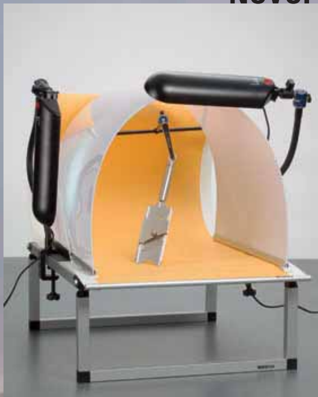
MS-TABLE 50, MS 50, MST 50, 2X MS-LIGHT, YELLOW BACKGROUND CARD, STASET HOLDER WITH PF-KLAMMER