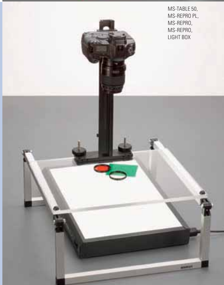
MS-TABLE 50, MS-REPRO PL, MS-REPRO, MS-REPRO, LIGHT BOX

These examples illustrate just a few of the ways you can use the NOVOFLEX MagicStudio equipment. Give your imagination free rein and enjoy a completely new experience in the world of table-top or repro photography. Please note: the set-ups pictured in this brochure often include not only the products described here, but also other components that may not be part of the product package. Check the product description in the product listing below for an accurate definition of the product contents. The key light sources operate off a 220-240 V supply voltage.