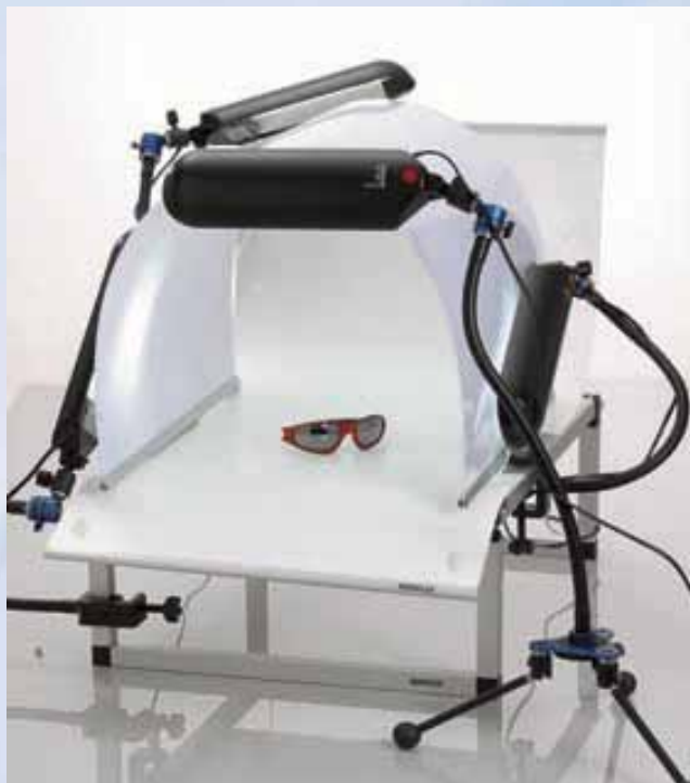
MS-TABLE 50, MS 50, MST 50, 3X MS-LIGHT, SPECIAL SET-UP WITH MINIPOD