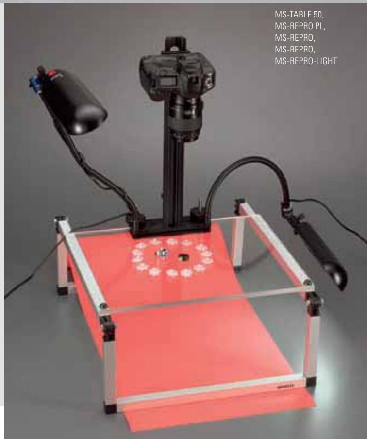
MS-TABLE 50, MS-REPRO PL, MS-REPRO, MS-REPRO, MS-REPRO-LIGHT

These examples illustrate just a few of the ways you can use the NOVOFLEX MagicStudio equipment. Give your imagination free rein and enjoy a completely new experience in the world of table-top or repro photography. Please note: the set-ups pictured in this brochure often include not only the products described here, but also other components that may not be part of the product package. Check the product description in the product listing below for an accurate definition of the product contents. The key light sources operate off a 220-240 V supply voltage.