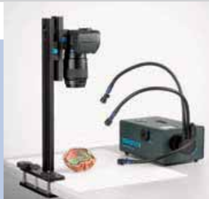
MS-REPRO, MS-REPRO B/W, FOCUSING RACK CASTEL-L, COLD LIGHT MAKL-150