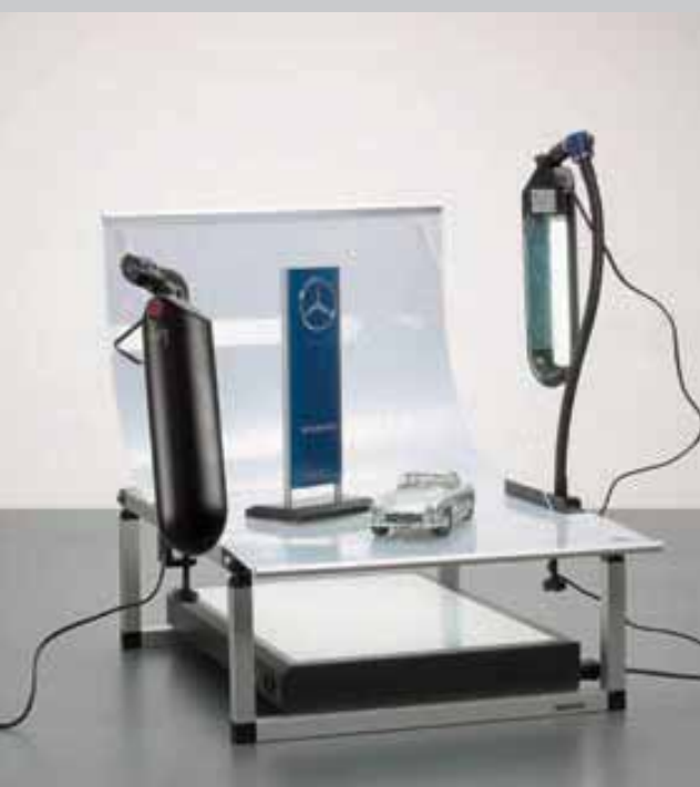
MS-TABLE 50, MST 50, 2X MS-LIGHT, LIGHT BOX