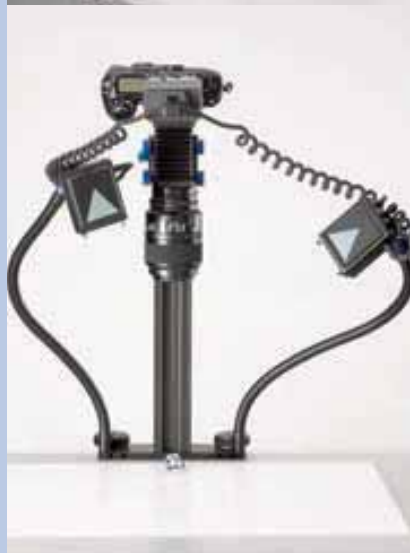
MS-REPRO, MS-REPRO B/W, 2X MARM, AUTO-DUO-FLASH