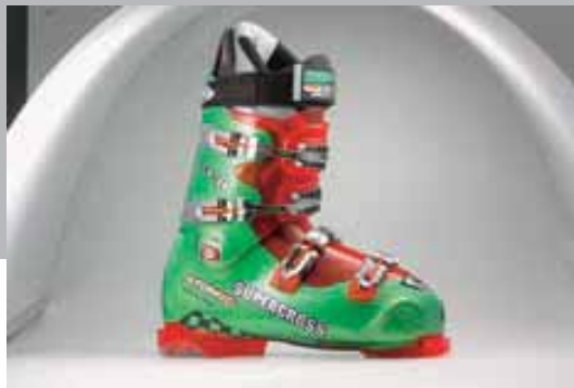
MS-TABLE 80, MS 80, 2X MS-LIGHT