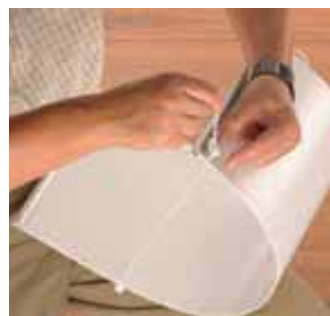
A STUDIO TAKES SHAPE

The tables are designed without cross struts, so that a translucent panel can be lit from below with no obstructions. A set of 12 colored backgrounds to fit the different table widths immediately give your pictures a truly professional look. NOVOFLEX also offers clamps, positioning aids, reflecting panels and a range of lighting equipment.