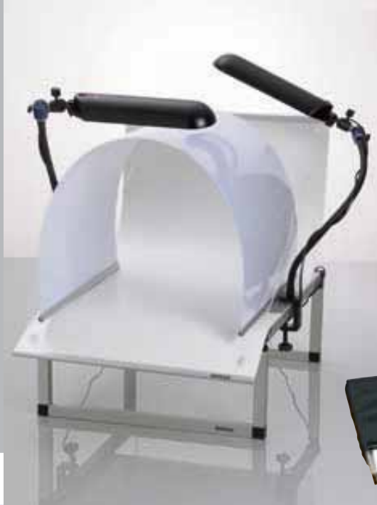
MAGICSTUDIO SET 50