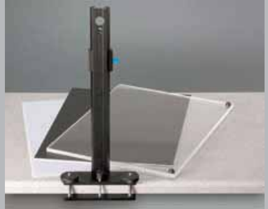
MAGICSTUDIO REPRO SET